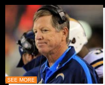
After massive firings in the NFL, what will happen next? Find out more