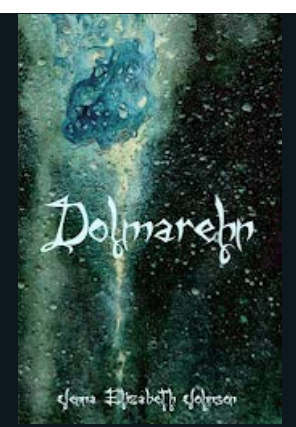
The second book in the Otherworld Trilogy

10. How can we contact you or find out more about your