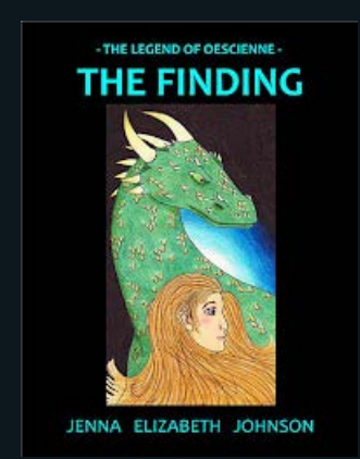
The ebook edition of The Finding is now FREE from Smashwords. Get your copy today!